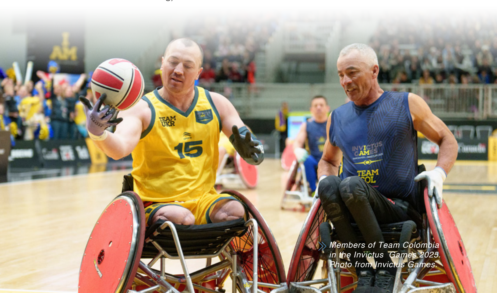
» Members of Team Colombia in the Invictus Games 2025.

For the first time in history, Colombian veterans won a medal in a winter sport at an international event—an achievement made possible through the support of allies such as the Ministry of Equality and Equity (providing airfare) and the U.S. Embassy (providing uniforms and thermal clothing).